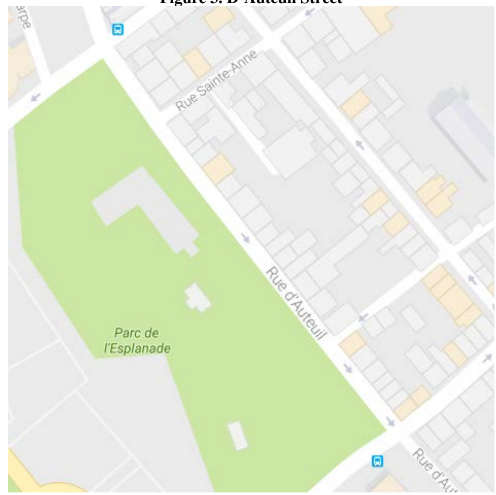
Figure 3. D'Auteuil Street